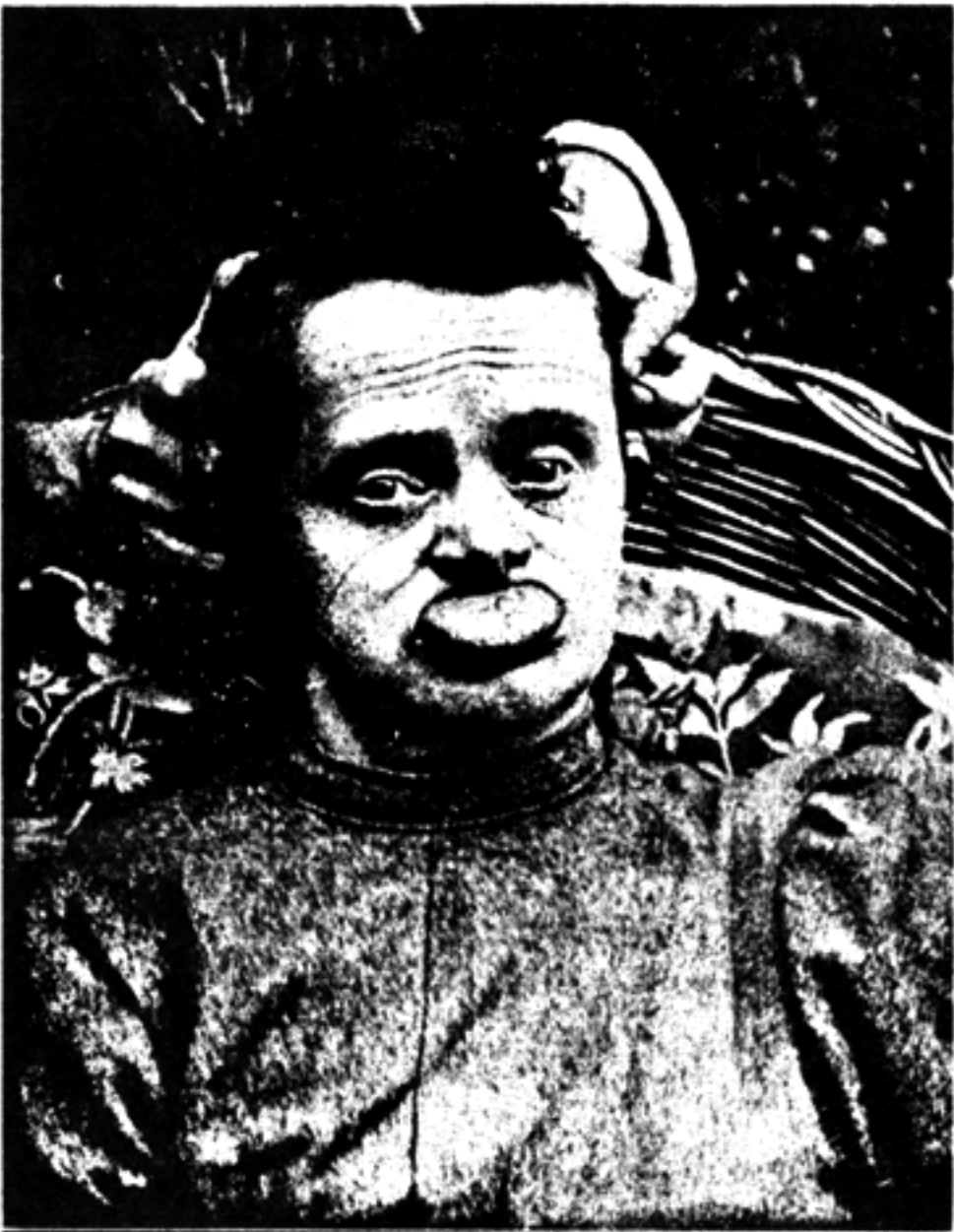
FIG. 24.—A mischievous, restless, and destructive imbecile of semi-Mongolian type; usually grimacing as shown.