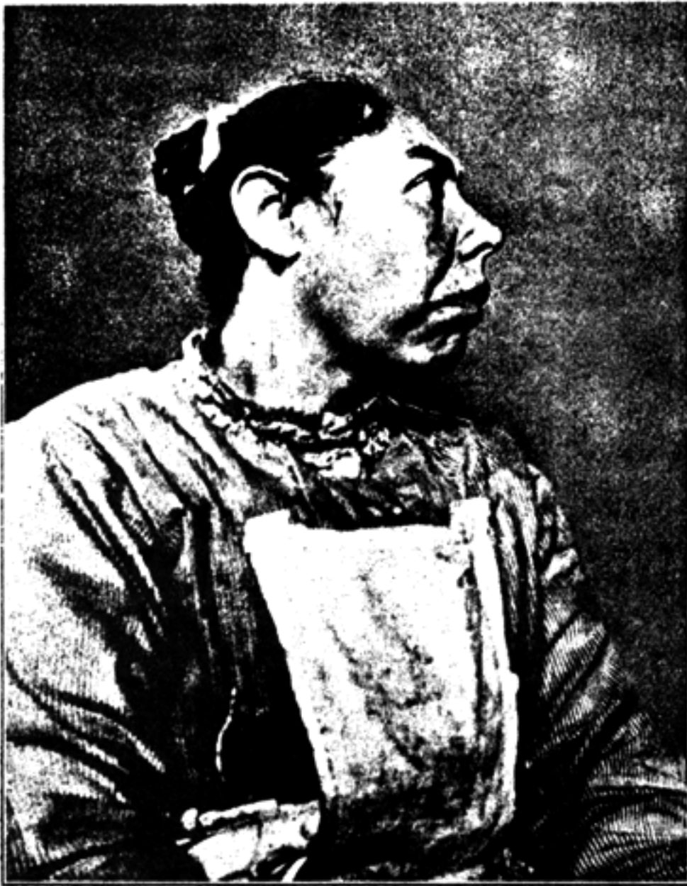
FIG. 32.—Microcephalic imbecile; a tolerably good worker in the wards. Head circumference, 17 inches.